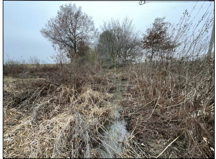
Channel on the Left.