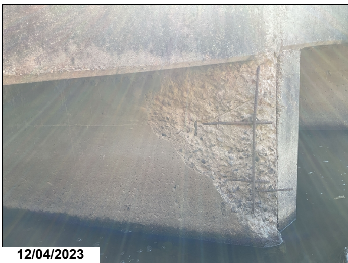
Barrel 3 Lt