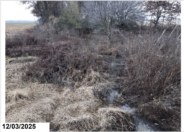
Channel on the Left.