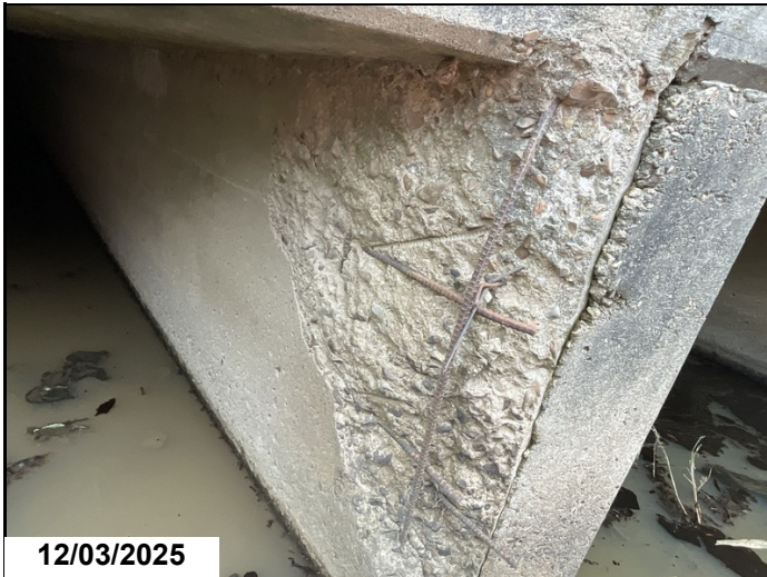
Barrel 3 division wall on Left