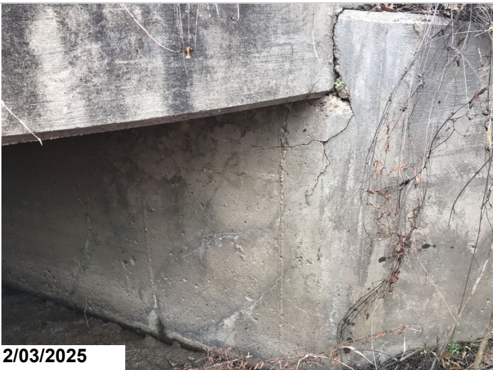
Barrel 3 Right end crack & delaminated area at connection to wing.