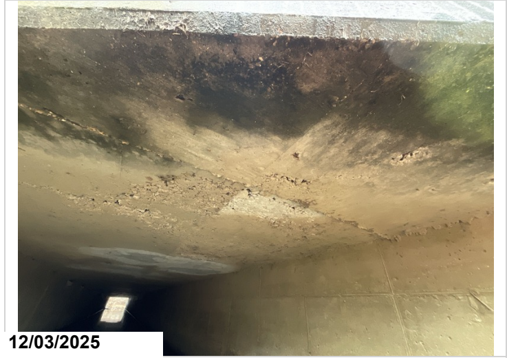
Barrel 2 top slab has minor honeycombed areas near Left end.