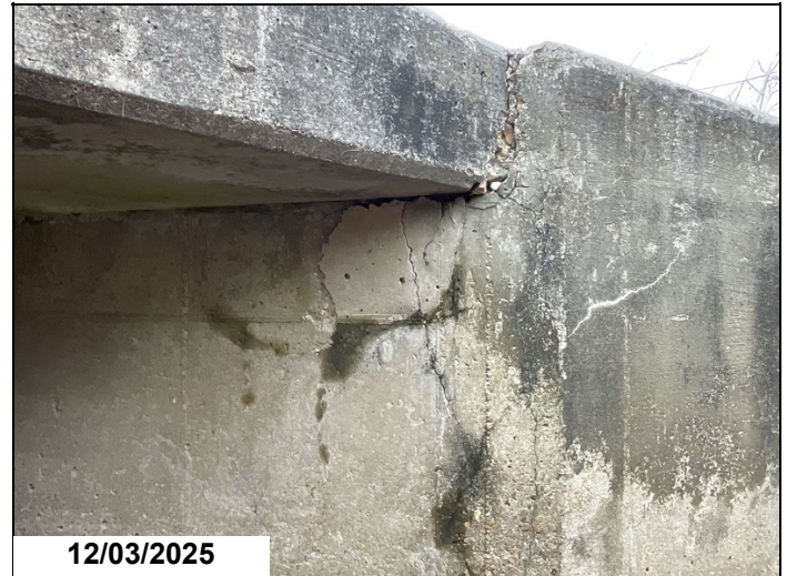
Barrel 1 near Left Wing