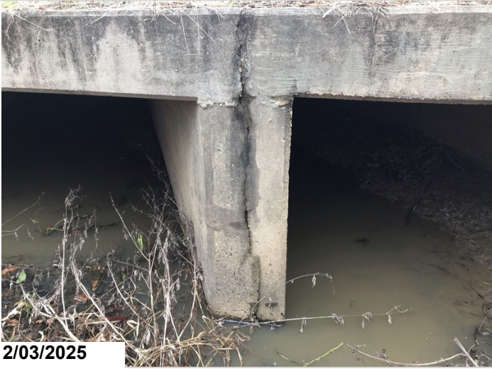
Headwall has a moderate vertical crack above Barrel 2 & 3 division wall on Right end.