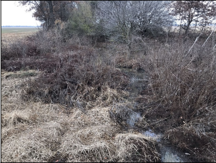
Channel on the Left.