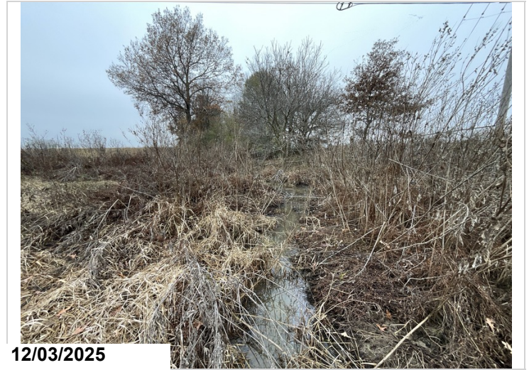
Channel on the Left.